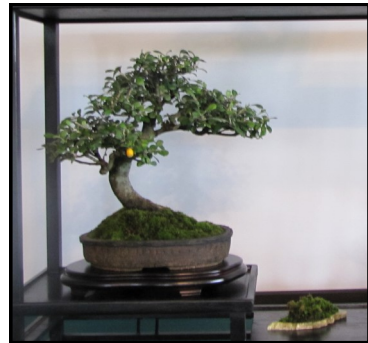
Above Left: Alan Van Trophy Best Tree and Pot Combination - Sandra Quintal - Corokia